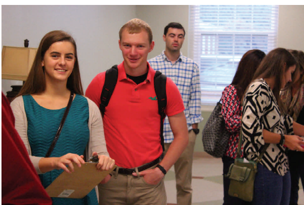
CANCAS students register and prepare for the day's events

On November 7 th , CANCAS held its annual Research and Career Workshop. Hosted by Pfeiffer University, this workshop brought together over 50 undergraduate students from a variety of schools including Lenoir Rhyne University, Campbell University, Pfeiffer University, Guilford College, and North Carolina State University. During the day-long event, students explored undergraduate research and study abroad opportunities, engaged in discussions with admissions representatives from professional schools, discussed the process on how to create scientific posters, and learned tips on writing scientific papers. Thanks to many engaging and expert presenters, the workshop participants had a full and rewarding day of networking and learning together. Many thanks to Pfeiffer University for their generous hospitality to the CANCAS group!